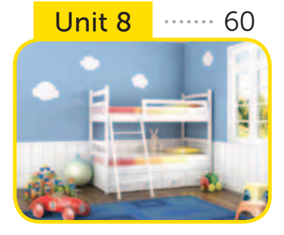
My Room It Is Under the Bed