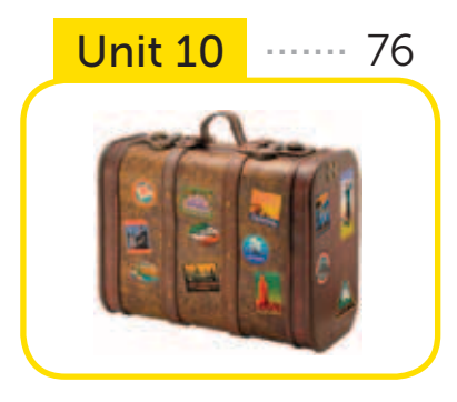
Vacation Summer Is Hot