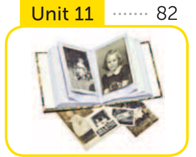
Time Machine Today I Am Happy