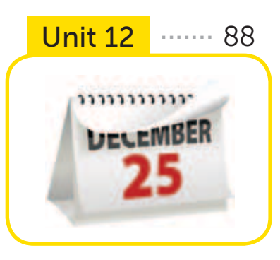
The Future Christmas Is in December