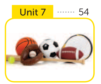
Hobbies I Am Good at Tennis