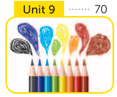
The Body My Shoes Are Purple