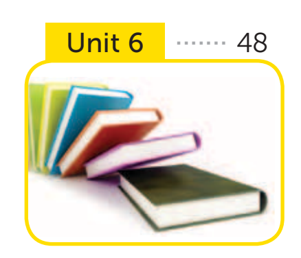
School I Go to School on Monday Morning