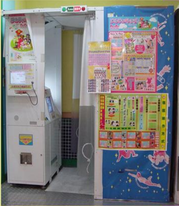
Photo machines are fun and popular. They let one, two, or even five people take photos together. Then, people add designs to the pictures. The result can be very cute and funny. The machine prepares the photos very quickly – in just a minute or so.

Friends love to take pictures together. They also like to give photos to other friends. People collect many of the small photos in plastic holders.