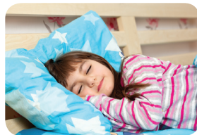
get enough sleep