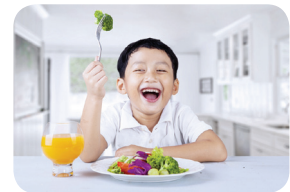
eat healthy food