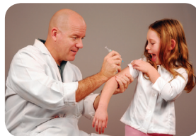
get a shot