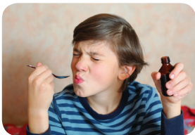
take some medicine