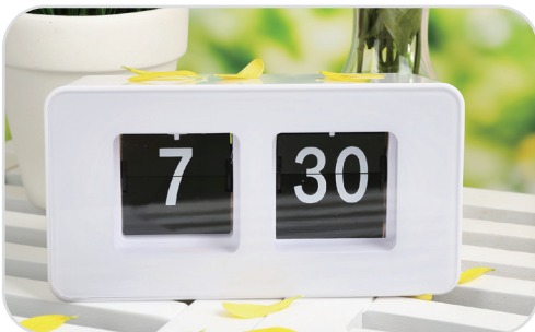
time / hand