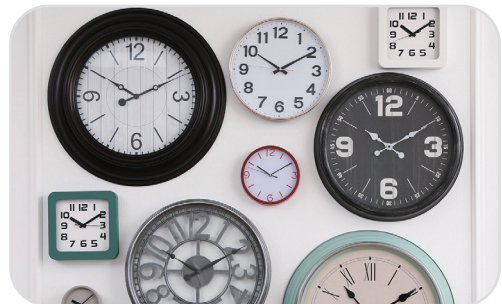
clocks / hours