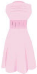
2 a _____ dress.