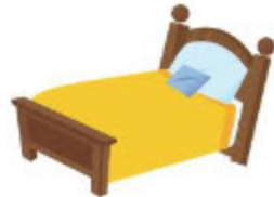
4 a _____ bed.