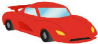
1 an expensive car.

2 Choose an adjective from Activity 1 to describe the pictures.