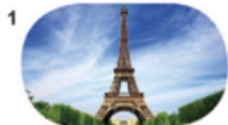
France / the Eiffel Tower