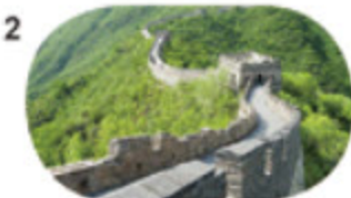
China / the Great Wall