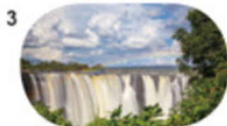
Zambia / Victoria Falls