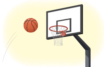
Good job / basketball