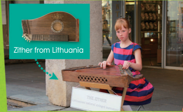
Zither from Lithuania