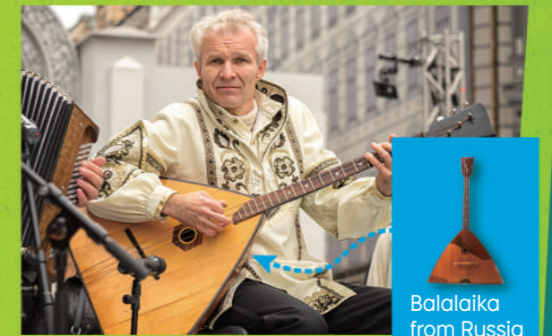
Balalaika from Russia