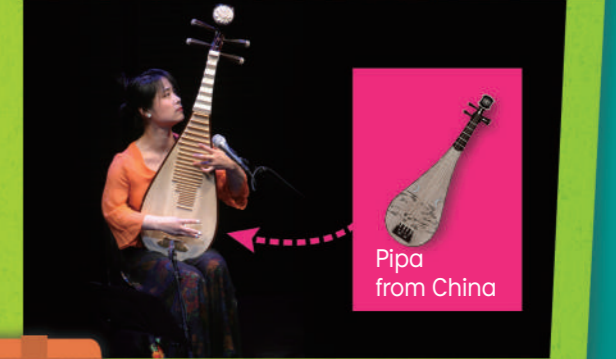
Pipa from China