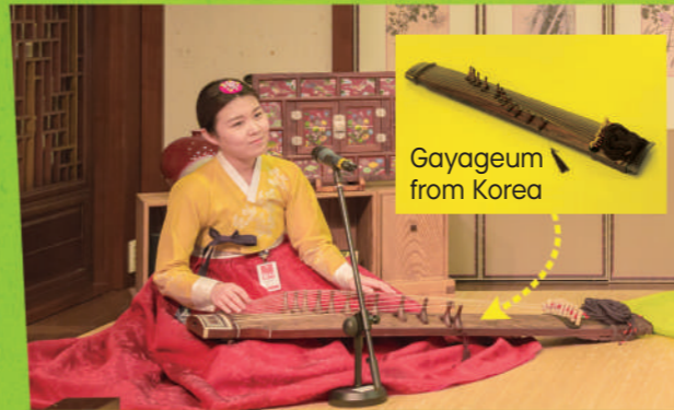
Gayageum from Korea

There are many different string instruments from around the world. They all look different, and they all make beautiful sounds.