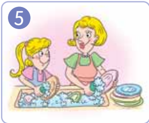
help your parents