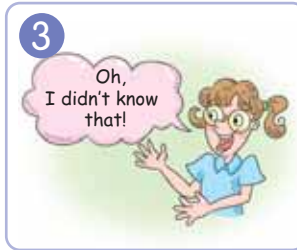
learn new things