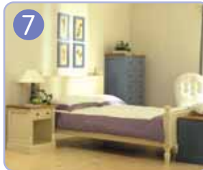
keep your bedroom tidy