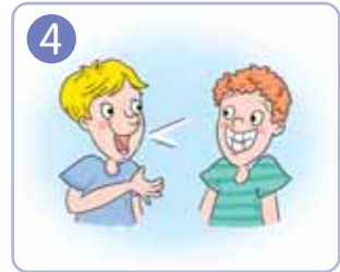
say nice things to people