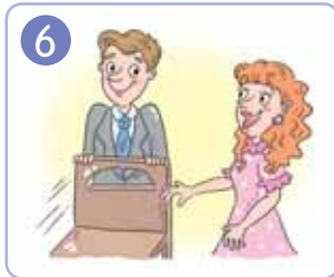
behave in a polite manner