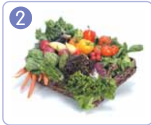
eat healthy food