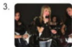
musician play in a band