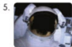
astronaut visit another planet