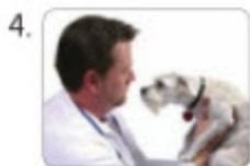
veterinarian (vet) take care of animals