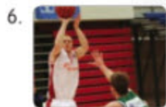
professional basketball player play basketball all the time