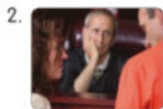
lawyer help people in trouble