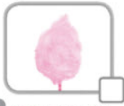
🔒 cotton candy