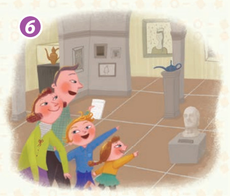
visit an art museum