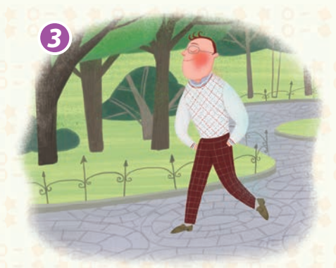
go for a walk