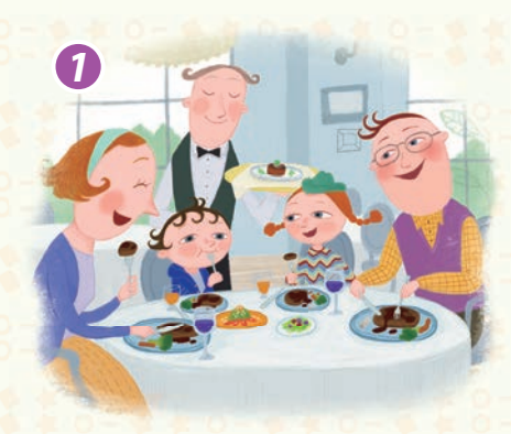
eat out at a restaurant