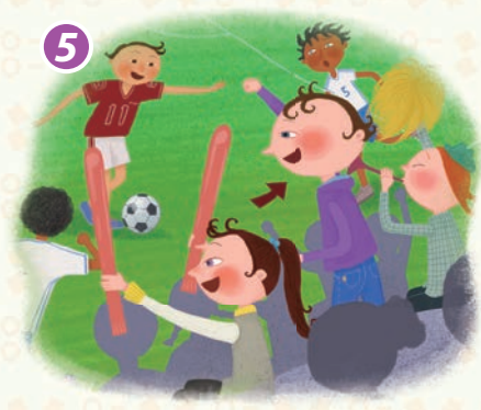
go to a soccer game