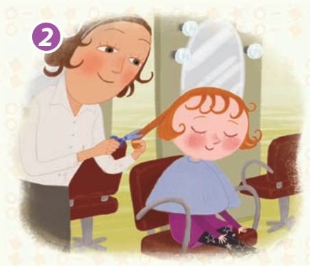
get a haircut