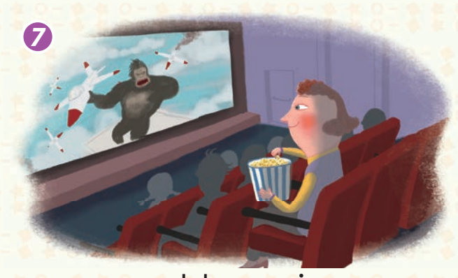
watch a movie