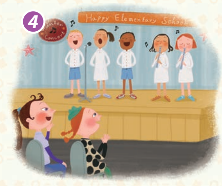
go to a school concert