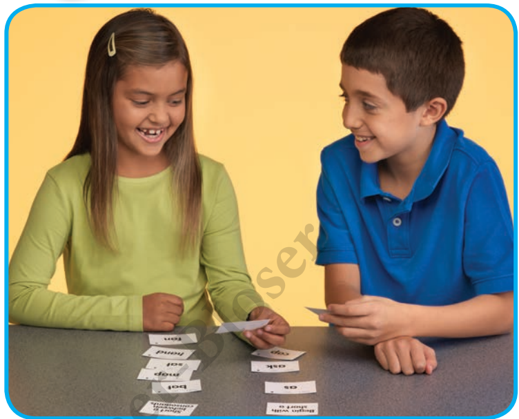
Buddy Sort using the word sort cards

A word sort helps you become a Word Detective. When you sort, you look for patterns in your spelling words. You see how words are the same and how they are different. Word sorting can help you remember how to spell words.