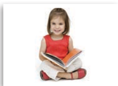
I love reading .